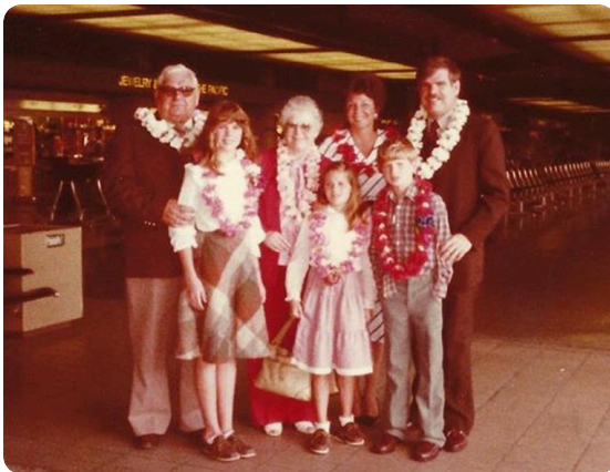
In Hawaii 1983?